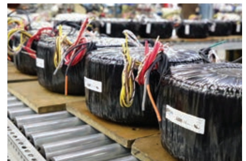
Torus Power's line-conditioning products are built around large and heavy toroidal transformers that filter out interference on the AC line, and supply large amounts of current to connected components on demand. Torus' parent company, Toronto-based Plitron Manufacturing, supplies power transformers to companies like Bryston and McIntosh, and also makes power products for hospitals, broadcasters and other industrial users.

But all generic cables cause losses, Salz says. "When we compare a cable with no cable, we hear a loss of sound quality: masking, compression, changes in tone. These are problems that a properly designed high-fidelity cable can cure."