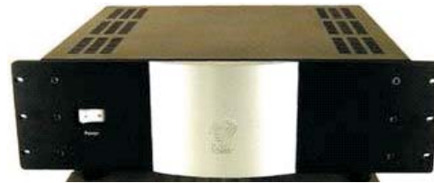
The Torus Power RM8A.

James of AV Designs called, "hey, are you having problems with the Torus Power?" I replied, "No, why would you say so?" James responded, "I just saw your posting called Power Struggle?, with a picture of the Pure Power and the Torus side by side".